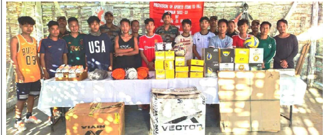
IT News Imphal, Nov 19:

Due to the remoteness of the Tamei Sub-division under Tamenglong district, combined with harsh hilly terrain, the locals have limited or no access to better sports facilities, sports infrastructure and material. Manipur has given many sports person of national stature and acclaim however the path to sports is hard. The immense hidden talent in sports is trapped due to the accessibility and remoteness of this place.