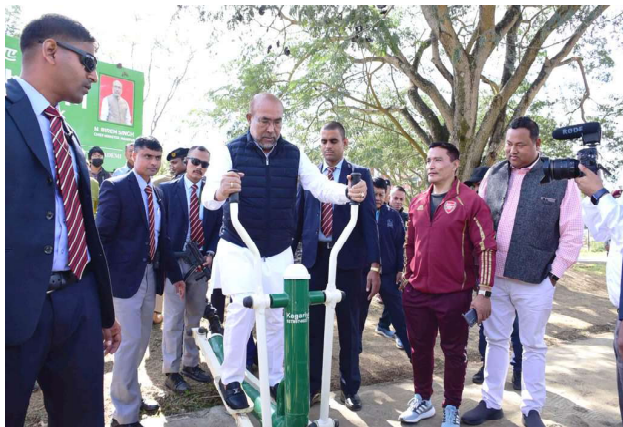
IT News Imphal, Nov 19:

"Health is wealth" and "Discipline is the foundation of a society," Chief Minister N. Biren Singh said today, stressing on the importance of discipline in the functioning of a society.