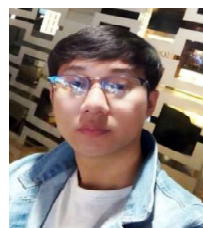
By: Nongpoknganba Soram

zens of that country. To fill the quench many are also migrating and converting to become the citizens of their country.