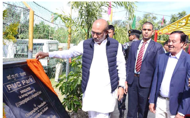
IT News Imphal, Nov 19:

Chief Minister N. Biren Singh today urged the youth of the State to build unity and work for the Nation and State shedding self-centered agendas and said when we work for the development of the Nation or State, we are working towards development of ourselves.