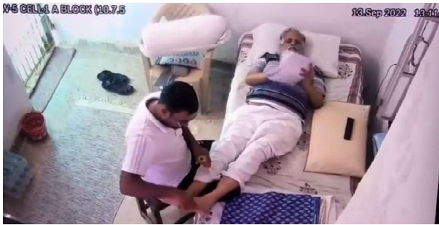
Agency New Delhi, Nov 19:

A CCTV video of Delhi minister Satyendar Jain getting a full body massage in Tihar Jail has emerged on social media two days after demands to shift the minister from the prison were raised by the Bharatiya Janata Party (BJP).