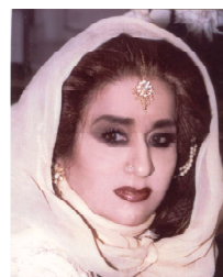
By: Shahnaz Husain

They contain polyphenols, which are powerful natural antioxidants. These not only have health benefits, but actually help to delay the visible signs of ageing on the skin and hair. They prevent and retard the degeneration caused by oxidation damage. Antioxidants also nourish skin cells and prevent skin damage. So, if you are prone to inflammation, dullness, and blemishes, you may opt for potent herbal teas.