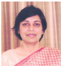
By: Vini Mahajan

While World Toilet Day may sound like a strange occasion to commemorate, it is critical to ensure health and hygiene for many. The dedicated day highlights the global sanitation crisis that affects millions of people around the world who are living without access to a safely managed toilet. Without clean, safe toilets, human waste contaminates communities' food and water sources, leading to sickness and even death, most commonly diarrheal deaths in severely affected areas. Also, in-